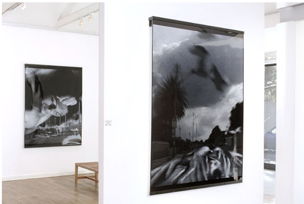
Riverrun Print Series